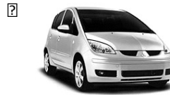
A Mitsubishi Colt 1.1

ALGARSERRA Private transfers to and from apartments are available. Please inquire.