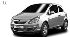
C Opel Corsa 1.2